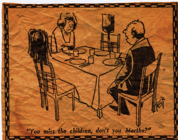
The things one finds under the Lino ... Red Hill's Reluctant Renovator sent us this. His wife couldn't see the joke.

remain in the area. Quite a few members are expressing interest in creating a co-operative venture.